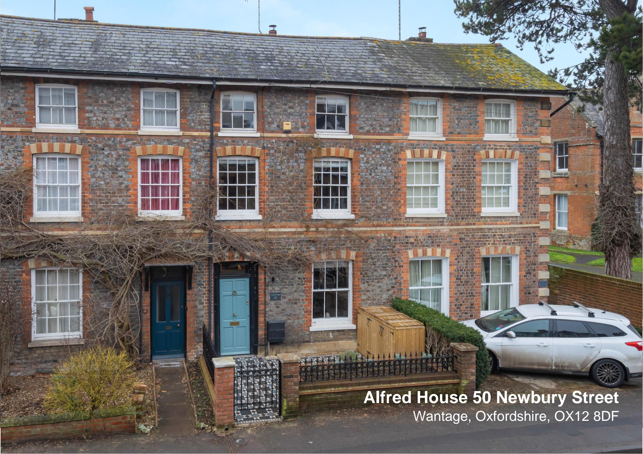
Alfred House 50 Newbury Street Wantage, Oxfordshire, OX12 8DF